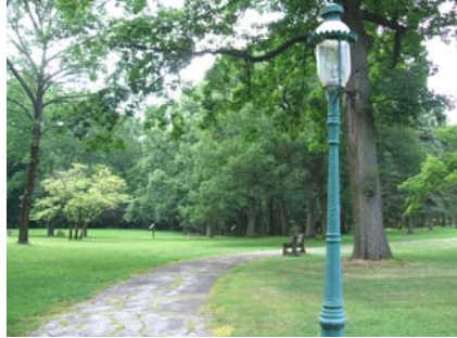
A View Toward A Lamppost On Our Grounds

The mission of Stritch is to serve the ministers of the Church in Chicago, as well as serve as a place of respite, quiet and prayer for all those affiliated